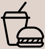
Food & Beverages

Halal Trade, Logistics and Manufacturing Expo will further strengthen Africa's position as a global halal hub and put forward the economic values of Halal for the world.